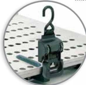
One-handed, black ratcheting straps