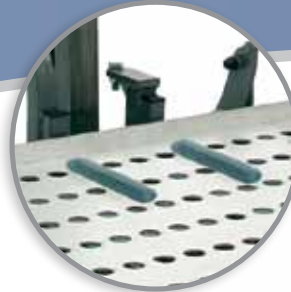
Standard adjustable wheel chocks

Note: Outlander Exterior Lifts can lift all of the listed scooters or power chairs with contoured, Synergy® or Specialty seating.