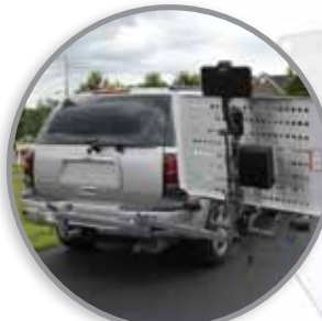
Optional swing-away adaptor