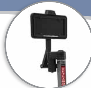
New standard license plate holder